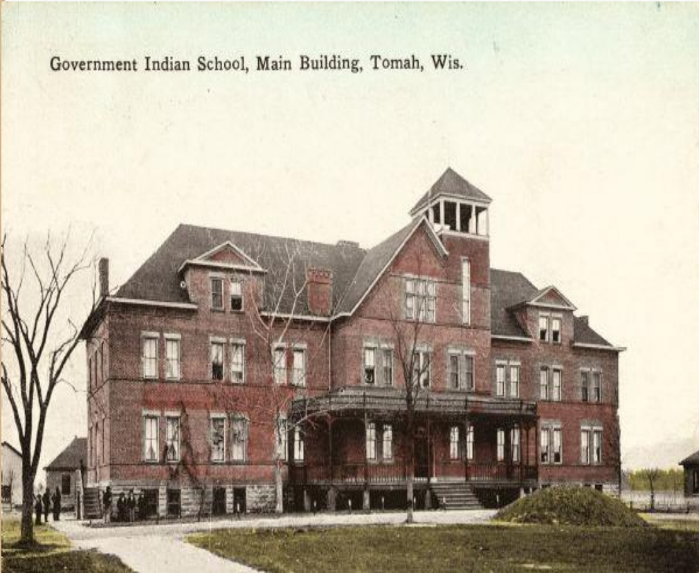
Government Indian School, Main Building, Tomah, Wis.